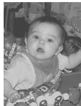
First Prize in the Category 0-11 Month