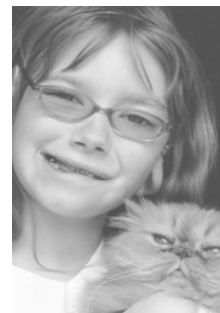
First Prize in the Category School Age