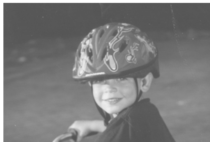
First Prize in the Category 1-4 years